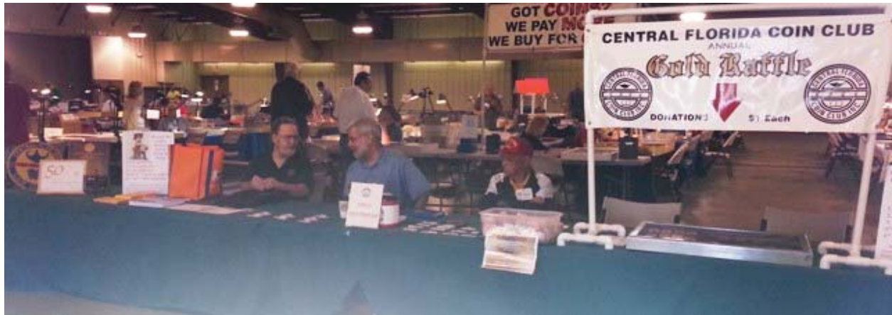
The Front Desk-Thanks to all who volunteered